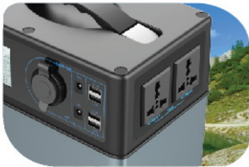
Pure sine wave inverter – supports up to 300W

The POWERplus Wallaby is your ideal companion for power needs in emergencies, camping, outdoor, boating etc. This product has an integrated pure sine wave inverter; which can provide the most stable AC voltage to power your AC electrical appliance up to 200W.